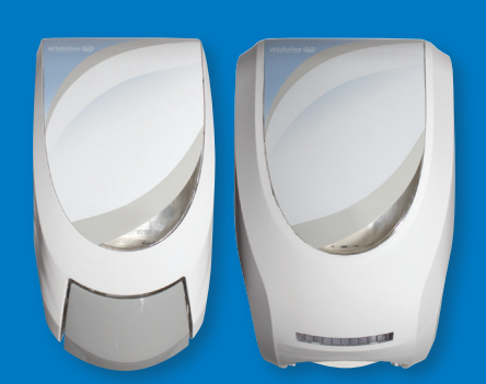
Dispensers are available in either manual or infrared (touch-free). Brackets available for 500mL packsize.

For more information on surface cleaners, disinfectants and hand hygiene products visit www.whiteley.com.au or email handhygiene@whiteley.com.au