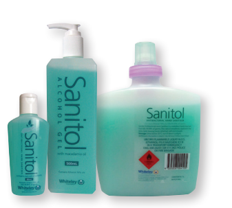
Pack Size: 85mL, 500mL, 1L pods