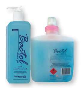
Pack Size: 500mL, 1L pods